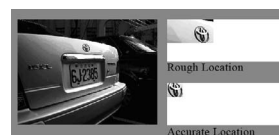
(a) The contrast between the license plates and background is not clear enough