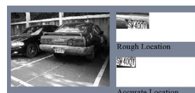
(b) Result of license plate detection when the plate is inclined and smaller