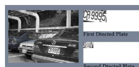
(c) Result of multiple plates in one image