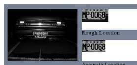
(a) Result of license plate detection in the night

The main idea of the thesis is to realize a system of license plate detection which is effective and fast-calculating. A novel approach for extracting license plate from cluttered scene is presented in this paper. The proposed system consists of three main stages, wavelet transform, roughly extracting candidate regions based on high frequency feature, and locating the exact license plate. The average accuracy of license plate detection is 92.4%. The experimental results show that our method has great effect in application. Therefore, no matter how the captured environment is changed, the desired license plate can be correctly located.