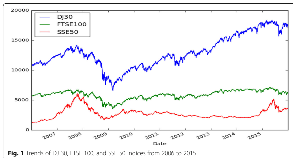
Fig. 1 Trends of DJ 30, FTSE 100, and SSE 50 indices from 2006 to 2015

We used the daily data for USDX, GBP/USD, and USD/CNY and the constituent stocks of the DJ 30, FTSE 100, and SSE 50 from Datastream (a financial database) from 2006 to 2015. Figure 1 shows an upward trend in the US stock market after the 2008 stock market crisis, a stable trend in the UK stock market, and two peaks, in 2007 and 2015,