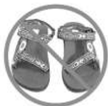
Sandals or Slippers

Participants are requested to arrive in a timely fashion for all addresses, whether to their own, or to those of other presenters. Presenters are reminded that the time slots should be divided fairly and equally between the number of presentations, and that they should not overrun. The session chair is asked to assume this timekeeping role.