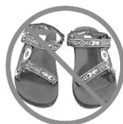
Sandals or Slippers

Participants are requested to arrive in a timely fashion for all addresses. Presenters are reminded that the time slots should be divided fairly and equally by the number of presentations, and that they should not overrun. The session chair is asked to assume this timekeeping role and to summarize key issues in each topic.