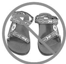
Sandals or Slippers

Participants are requested to arrive in a timely fashion for all addresses, whether to their own, or to those of other presenters. Presenters are reminded that the time slots should be divided fairly and equally between the number of presentations, and that they should not overrun. The session chair is asked to assume this timekeeping role.