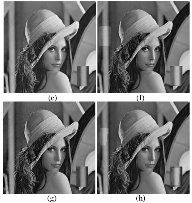
Fig. 2. (a) one copy-move forgery image, (b) the proposed forgery detected result of (a), (c) the JPEG QF=95 of (a), (d) the proposed forgery detected result of (c), (e) the JPEG QF=75 of (a), (f) the proposed forgery detected result of (e), (g) the JPEG QF=50 of (a), (h) the proposed forgery detected result of (g).

Table 1 lists the true positive rate and false positive rate between the proposed scheme and EB algorithm [10]. The true positive rate is defined by the rate of an algorithm identifies the forgery pixels in a forgery region. The false positive rate defines the ratio of an algorithm recognize not forgery pixels as a forgery region. Table 1 shows that the proposed scheme has better detection results than EB algorithm. Moreover, Table 1 also shows that the detection rate is decayed according to the image quality reduction by higher JPEG compressions.