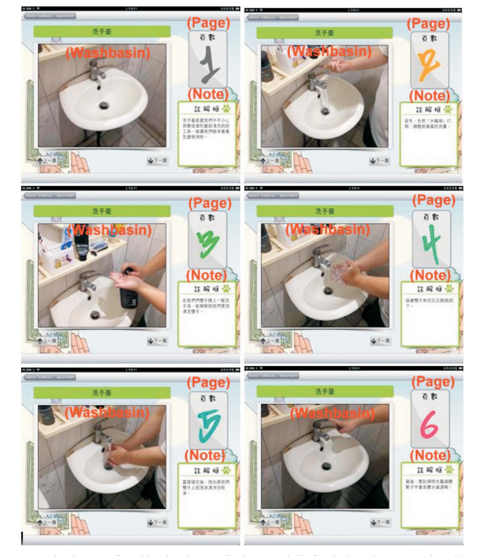
Figure 4. Six pictures of washing hands are edited sequentially for the learning target of washbasin.

AustimSpace is published on the iTune App Store [15], and the source code of AustimSpace is also pro-