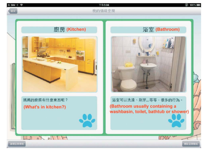
Figure 2. The scenerio space of kichen and bathroom.

In the second step, the caretakers click on the screen of tablet PC to layer learning targets on top of the scenario picture. In Figure 3, the mirror, toothbrush, and washbasin of the scenario picture are set as learning targets. The contents of these learning targets, which are including washing face, washing hands and tooth brushing, are shown as colored icons on the scenario picture, respectively. After setting a learning target, the caretakers then embed the corresponding pictures or videos. The embedded method is quite simple and intui-