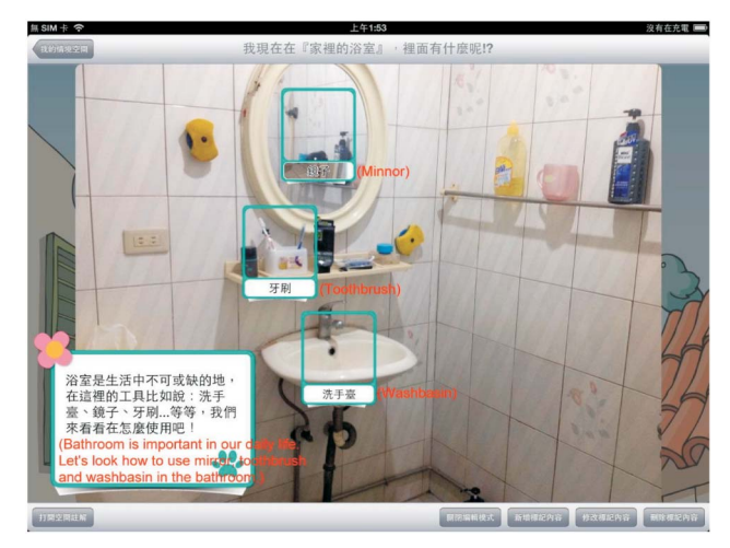
Figure 3. Setting the mirror, toothbrush, and washbasin as learning targets on the scenario space.