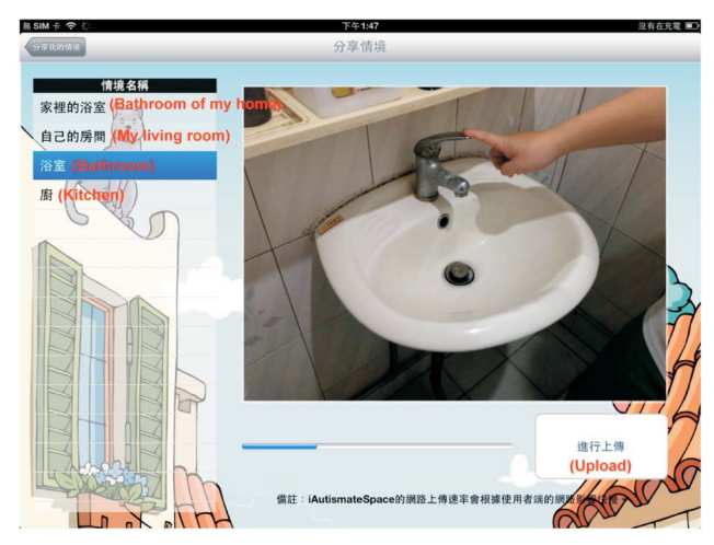
Figure 5. AustimSpace employ a cloud server to share the contents of learning scenario for caretakers.

AustimSpace: A Visualized Scenario Learning Aid on Tablet PC for Chinese Children with High-Functioning Autism 93